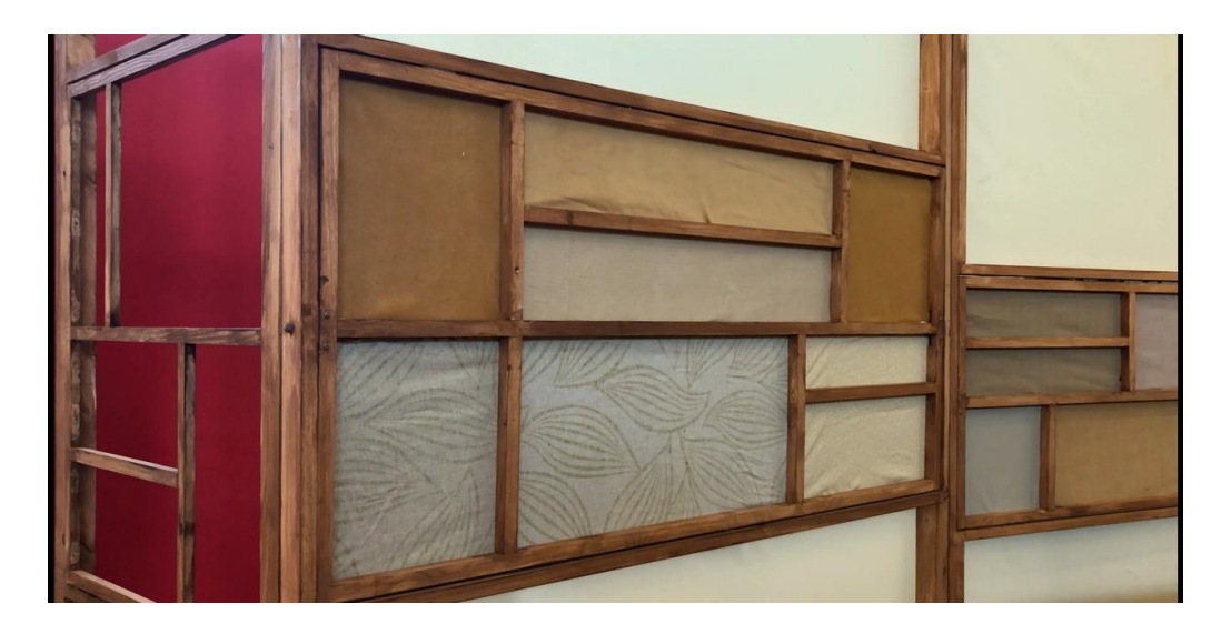
The screens will flip around like this.

There are screens around the performance area and behind where you'll be sitting that look like this.