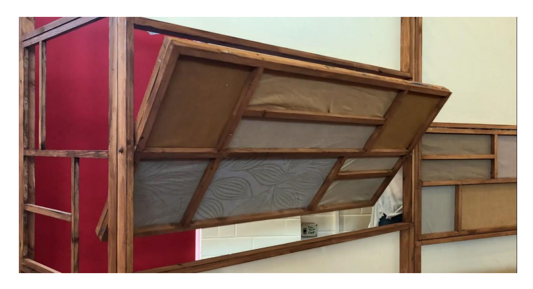
And on the other side they are different colours.