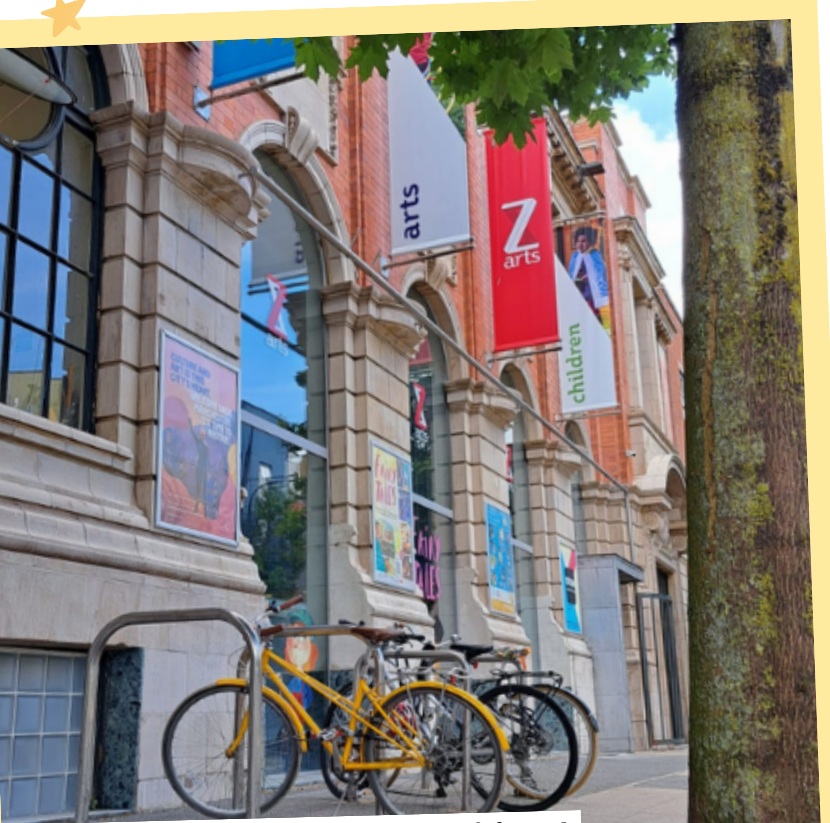
Our beautiful Edwardian building!