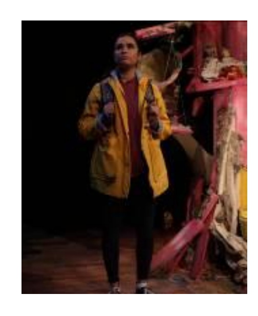
Titch is taken on a tour of the house. During the tour of the house she will her strange noises and might scream.