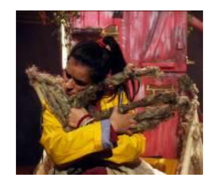
At first Titch is scared of the Dust Monster, but by the end of the show they become friends.