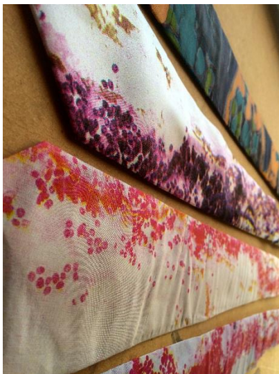
Z-artist Sally Gilford creates textile designs inspired by biology.